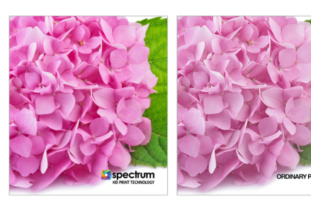
Vibrant Colors Colors appears richer, more saturated and vibrant.